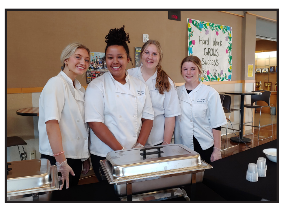
Above: Culinary arts students prepare breakfast for staff during an in-service learning day. Bottom right: A student in Advanced Floral Designs displays a completed bouquet.